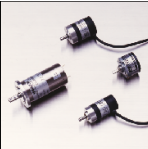
Photo Encoder and Tacho